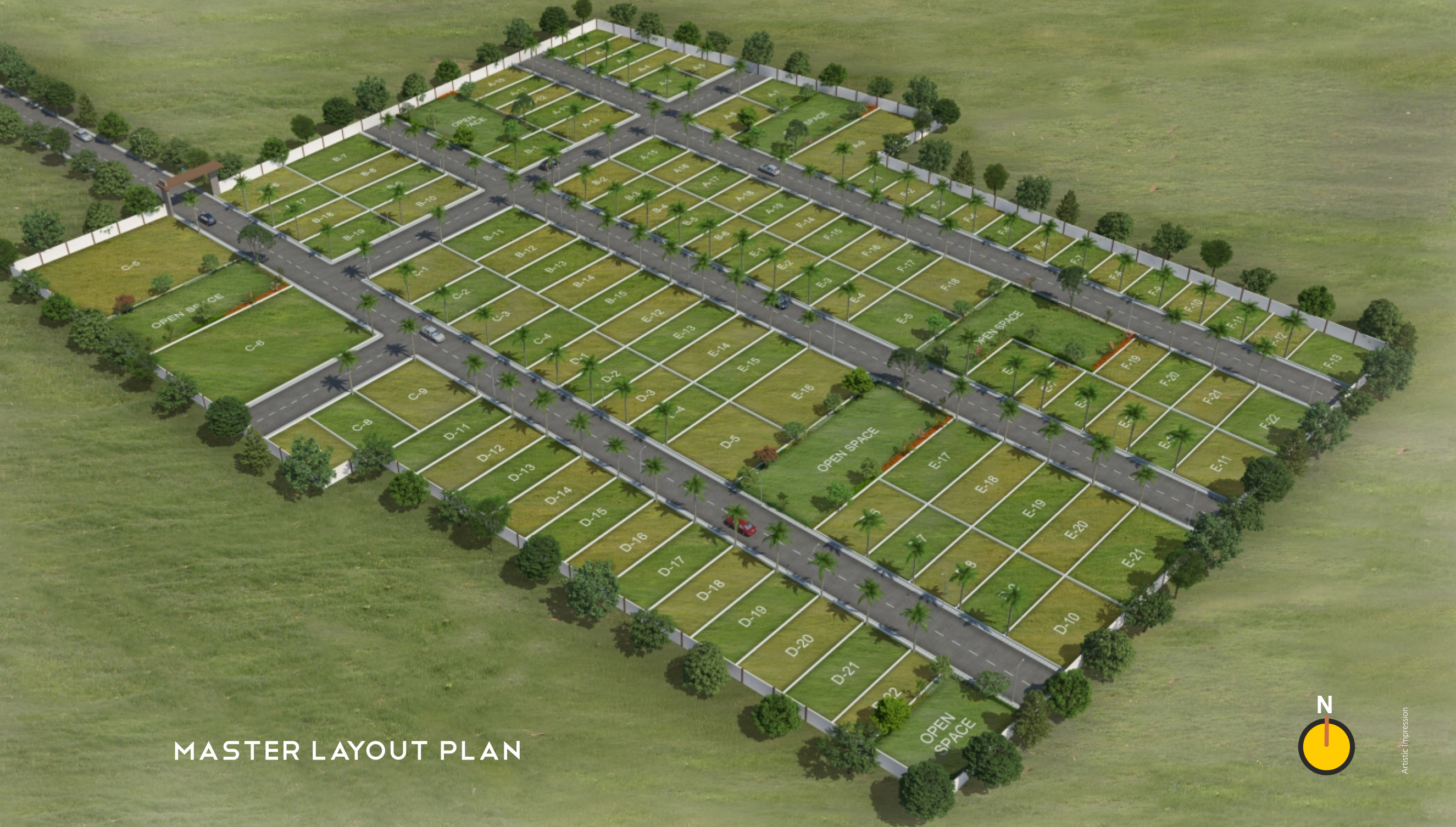
MASTER LAYOUT PLAN